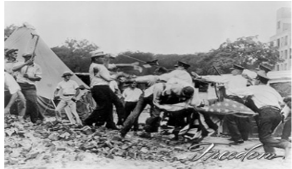
Armed Guards disperse Bonus Army Protestors. Washington DC, July 29, 1932

Examining English and American welfare systems shows a pattern of repeated initiation, expansion and cutback of welfare programs that corresponds to this cycle.